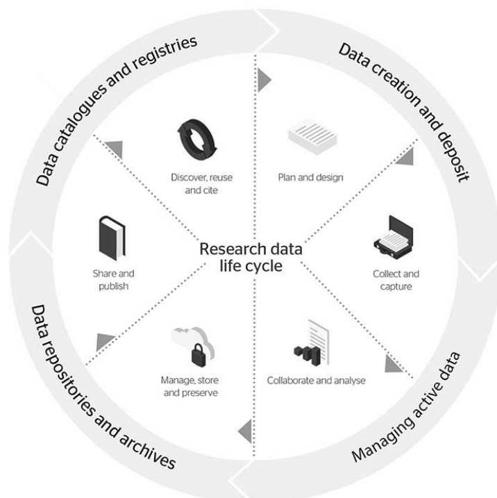
Figure 2: The life cycle of research data 27